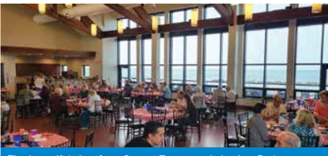
The beautiful view from Sunset Terrace at Lakeview Park.