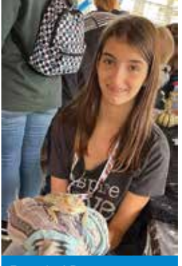
Bearded Dragon at Cage-N-Tank Reptile Exhibit.