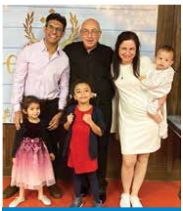
Welcome to St. Andrew Church.

preparing pierogies, stuffed cabbage, noodle dishes, etc. They raised over $5,000.<sup>00</sup>. Father Budash and Deacon Knapp are very grateful for GCU Matching Funds.