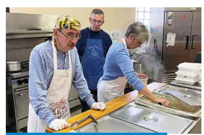
Lodge members who helped make the Slavic Dinner a