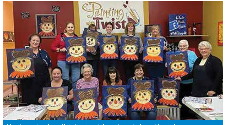
Members showing off their artwork from the painting with a twist.