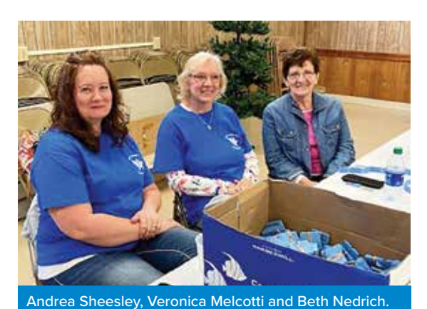
Lodge 401 NANTY GLO, PA

During the month of September GCU Lodge 401 sponsored two events in the St. Nicholas Church hall.