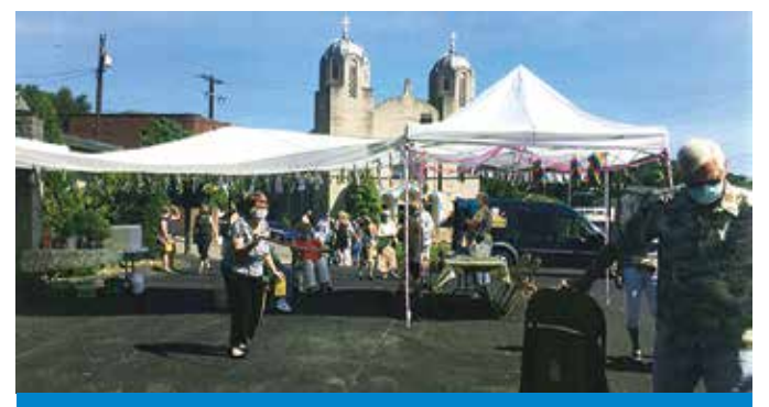
Friends and family begin to arrive for the outdoor celebration with St. John's Church domes outlined in the background's clear blue sky.