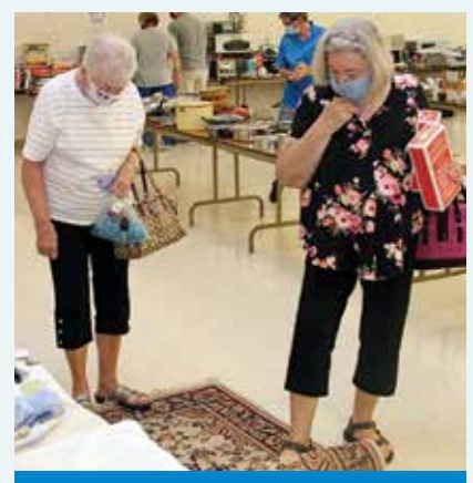
Lots of items to select from at the flea market.

Several SEPRL members assisted with take-out meals offered over three weekends, one in July, August and September, at St. John BC Cathedral in Munhall. Stuffed cabbage, mashed potatoes, vegetables, roll & butter were served in July & August. Over 800 dinners were sold over the two weekends. The third dinner, served the weekend of September 19 & 20, was a Cathedral specialty-Chicken Supreme Dinner. This was a favorite back in the 80's & 90's when parishioners did all of the catering at the Cathedral Center. A total of 281 dinners of chicken breast in a while wine sauce, rice pilaf, vegetables and roll & butter, were sold. Along with the dinners, a bake sale was offered featuring Kathedral Kolache and Fr. Andrew's paska, cinnamon bread & cinnamon/raisin bread. There were also apple dumplings, cakes, cookies and apricot/nut torte. Thanks to all who supported these fundraising events and those who helped make them a success.