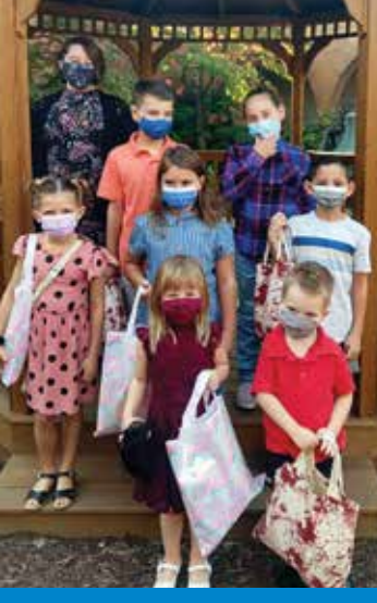
First day of ECF classes.