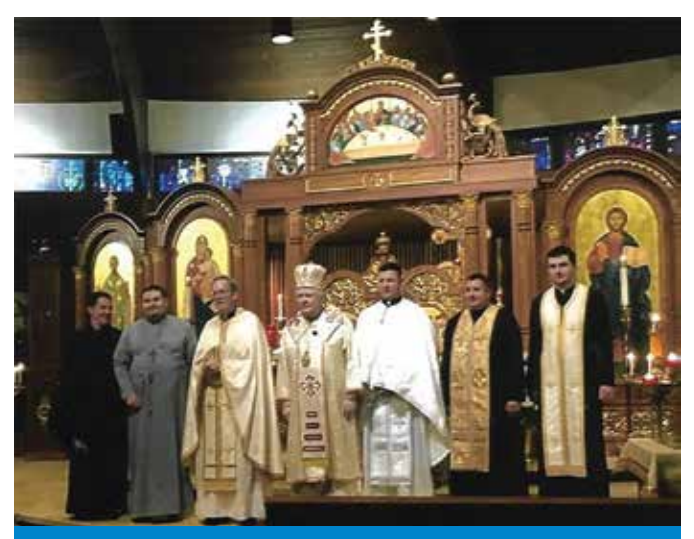
Golden Anniversary Liturgy & Celebration.