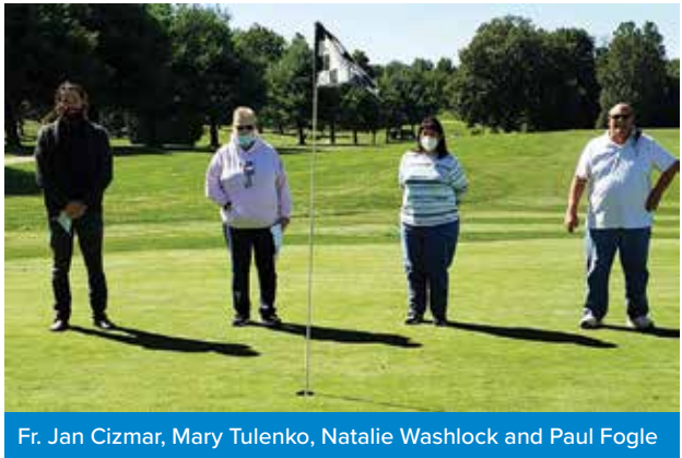
at the golf ball drop.