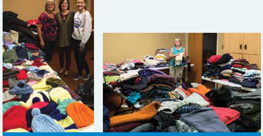
Winter items and clothing drive items collected at the Cathedral.

Ascension Church members collected items for Sisters Place in September for Community Matching Funds. Sisters Place provides support for single mothers with education, parenting classes, assistance with housing, budgeting and other life skills.